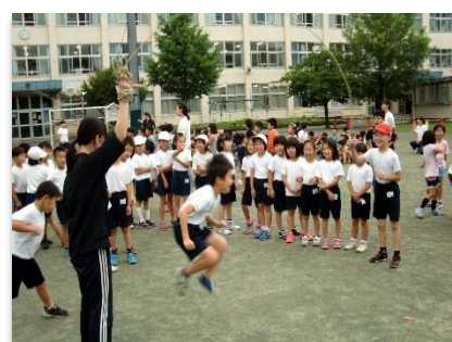
Long Rope Jumping Competition