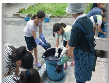
Indigo dyeing experience