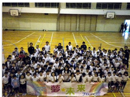
Olympic & Paralympic orientation