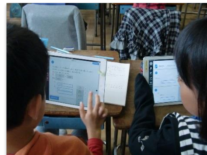
Using Tablets in Class